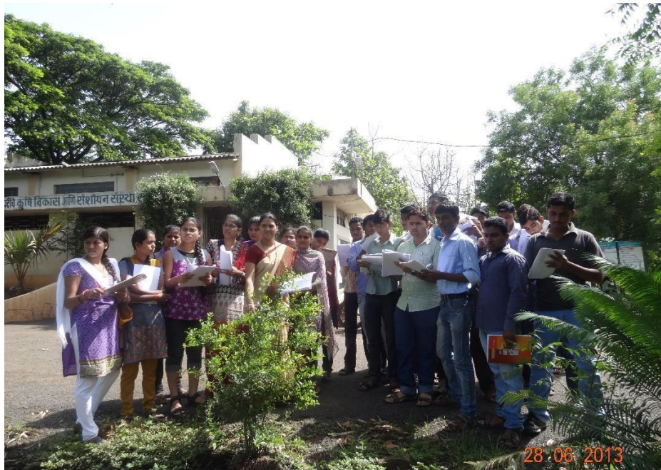
Field visit @ Campus RSCMC ABM